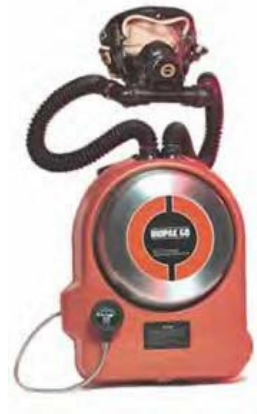
The BioPak Closed Circuit Breathing Apparatus.